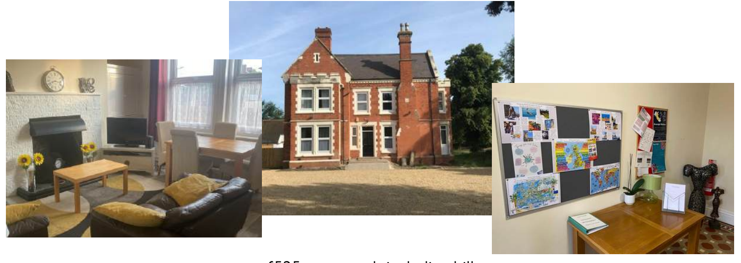
£525 per month including bills. £150 deposit.

Shared staff accommodation is available on a temporary basis in the local town of Melton Mowbray and is on the free staff minibus route. Melton Mowbray is around a 20 minute drive from Ragdale Village. It is quite a large town with plenty to do. You would live with other beauty therapists and staff members of Ragdale.